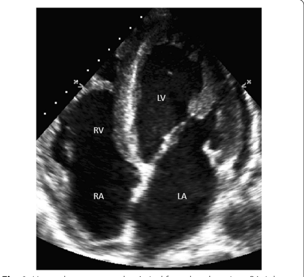
Fig. 1 Heart ultrasounography. Apical four chamber view. RA right atrium, RV right ventricle, LA left atrium, LV left ventricle

With the apical four-chambers view, the CVC was considered correctly positioned when a laminar saline swirl entering the right atrium was observed immediately after saline injection as previously described [16],