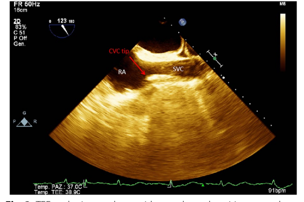
Fig. 3 TEE probe inserted at a mid-oesophageal position, turned clockwise and rotated to 123° to produce a mid-oesophageal SVC-RA junction visualization. Red arrow: central venous catheter tip at SCV-RA junction. SVC superior vena cava, RA right atrium, CVC tip central venous catheter tip

By TEE probe via mid-oesophageal bicaval view (90^{\circ}-10^{\circ}) (Fig. 3), the CVC was considered correctly positioned when the CVC tip was identified in the last 3 cm of the SVC measured from cresta terminalis (CT). Misplacement was defined as the catheter tip too distal in RA or too proximal in the SVC (more than 3 cm above the cresta terminalis) or not directly visualized by B-mode ultrasound, despite the appearance of a laminar jet flow coming from the SVC. The catheter was identified as two closely spaced, parallel, bright hyperechoic lines surrounding the dark fluid-filled lumen. (Additional file 3).