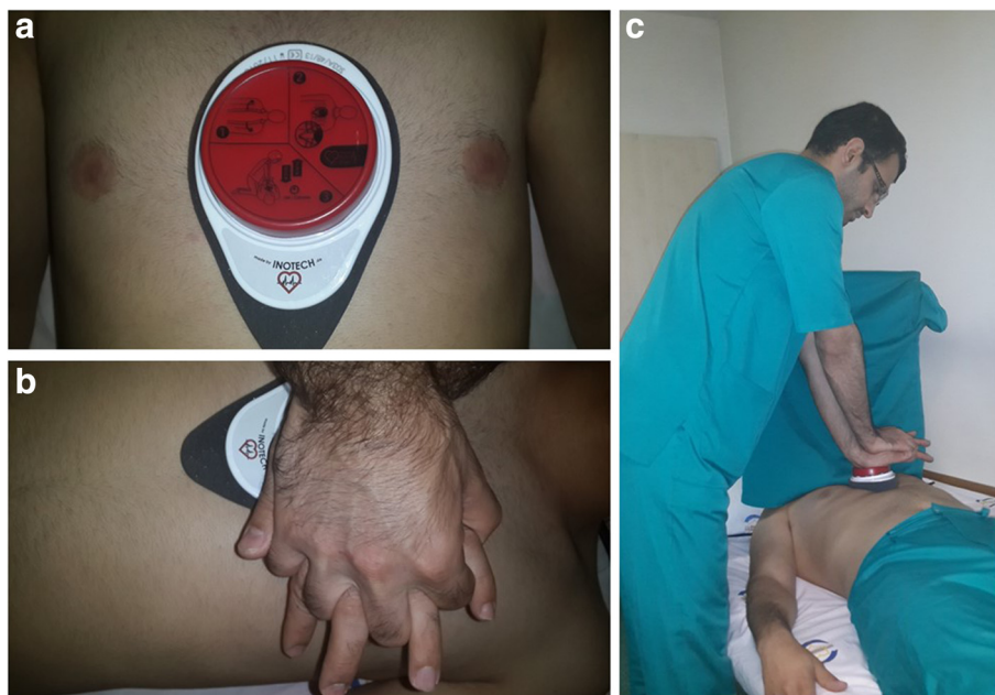
Fig. 2 Illustration of proper positioning of the Cardio First Angel™ device. a The device is positioned over the lower one-third of the sternum. The rescuer-side portion consists of a red, round push-button that displays a pictogram illustrating proper device use. b The push-button fits in the palm of the rescuer's hand as it would lie on the sternum during manual cardiopulmonary resuscitation (CPR). c The rescuer should maintain straight arms and back and flex at the waist as in standard manual CPR

The Cardio First Angel™ is a lightweight device (130 g, 4.5 oz) that consists of three components (Fig. 2). The rescuer-side portion consists of a red, round push-button that fits in the palm of the rescuer's hand as it would lie on the sternum during manual CPR. This rescuer-side component displays a pictogram illustrating proper device use. The center unit is composed of a stable plastic base that contains a complex arrangement of springs to transfer force to the patient's thorax. The patient side of the device consists of liquid-absorbent polyurethane foam that disperses the compression force evenly across the device footprint. Application of 400 \pm 30 N of force (41 kg or 90 lb of pressure), which correlates to a sternum compression depth of 50–60 mm, is followed by an audible “click” sound to alert the rescuer to cease compression. The “click” sound is also audible upon spring decompression, alerting the rescuer to resume compression.