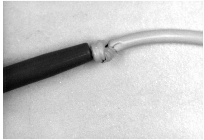
Tracheostomy dilator and pulmonary artery catheter after removal.

Bjaeverskov, Denmark) was inserted over the remaining part of the catheter without encountering any resistance. The catheter was carefully withdrawn until the knot reached the end of the dilator. There the knot was pulled tighter, but could not be retracted into the dilator. The knot had approximately the same circumference as the middle part of the dilator, however, and together they were removed without the occurrence of any further complications (Fig 2).