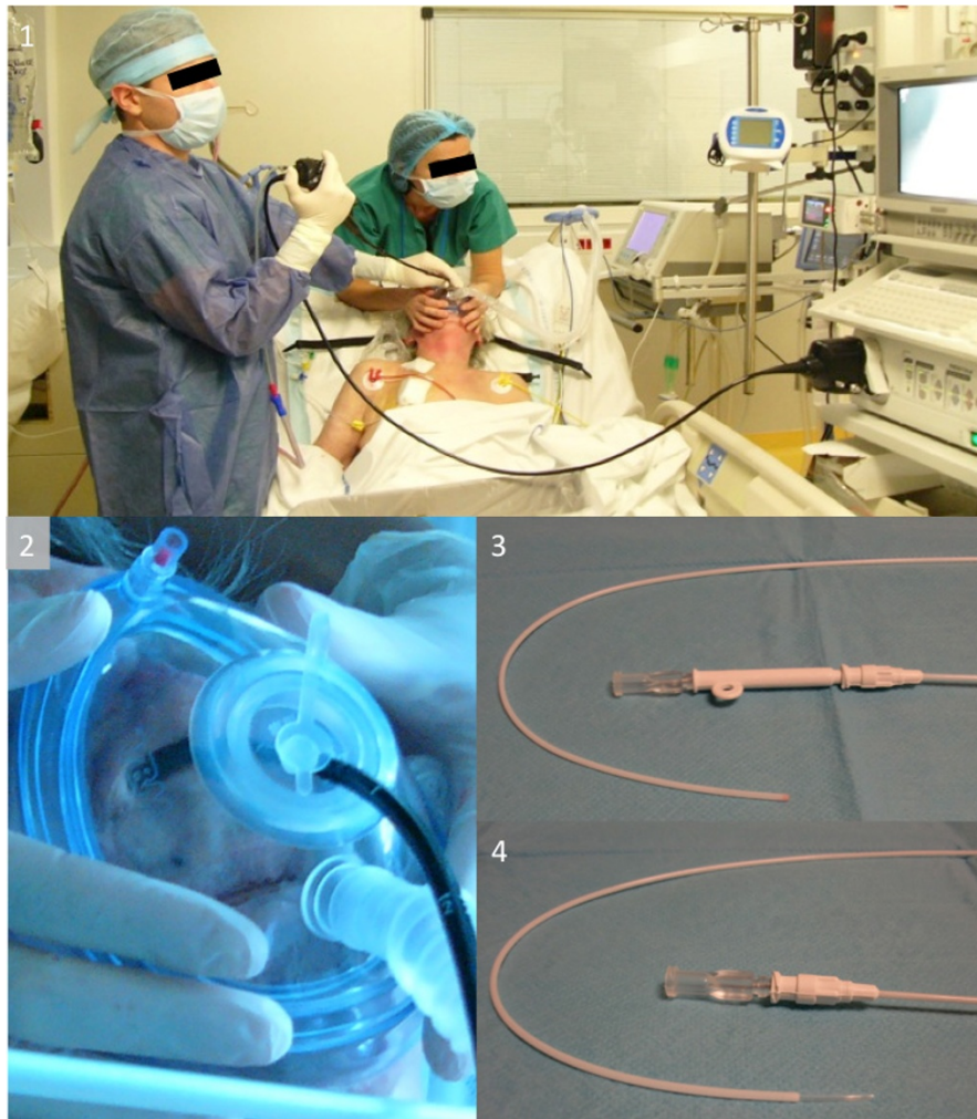
Figure 1 Fiberoptic bronchoscope-guided distal protected small volume bronchoalveolar lavage (FODP mini-BAL). 1) FODP mini-BAL during non invasive ventilation. 2) Specific interface to perform fiberoptic bronchoscopy during non invasive ventilation. 3) Telescopic catheter Combicath ® before deployment. 4) Telescopic catheter Combicath ® deployed.

pathogen identification between the fiberoptic and blood culture techniques with a two-sided chi-square test and \alpha set at 0.05. Continuous variables were compared using paired or unpaired Wilcoxon rank-sum tests. Categorical variables were compared using the chi-square test or Fisher's exact test when appropriate. A P -value < .05 was considered statistically significant. All statistical analyses were performed using JMP 8.0.1 statistical software (SAS Institute, Cary, NC, USA).