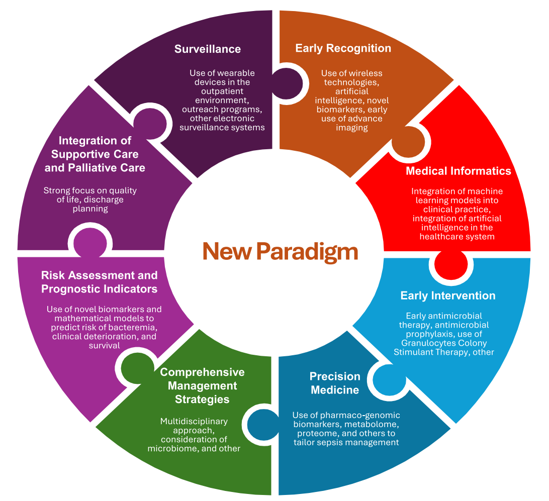
Fig. 2 New Paradigm. Despite a rise in prevalence and severity of septic shock in immunosuppressed patients, survival has improved over time. An advanced stage of the disease should not deter from ICU admission, nor the use of novel technologies such as wearable devices, outreach programs, artificial intelligence, and machine learning models for early detection and diagnosis. Critical care should remain in line with values and preference of the patient supported by their family

Cancer incidence rates are rising, and so are the rates of septic shock among these patient populations. Malignancies are risk factors for sepsis and septic shock due to their impact on both innate and acquired immunity. Infection symptoms in cancer patients may be lacking, necessitating a high index of suspicion and early