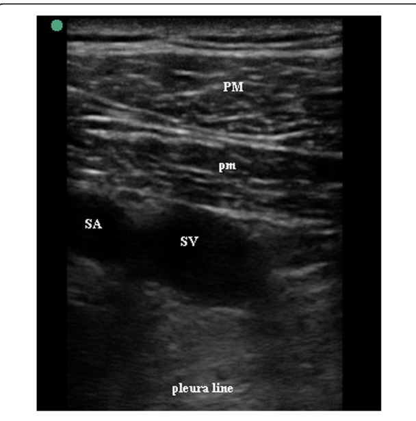
Fig. 2 Oblique-axis view of subclavian vein and artery. SV subclavian vein, SA subclavian artery, PM pectoralis major, pm pectoralis minor