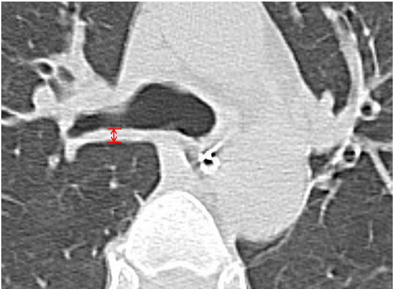
Figure 1 Indices of bronchial wall thickness on HRCT scan. Measurement position of bronchial-wall thickness (arrows). HRCT, helical high-resolution computed tomography.

in 29 of the 37 patients at all three time points. In eight patients, CT was not performed at 24 hours or 7 days after admission because of early discharge (within 4 days; n = 6 ) or respiratory or circulatory compromise within 24 hours of admission ( n = 2 ). In the early-discharge patients, informed consent for examination by follow-up CT at 24 hours after admission could not be obtained. All patients exhibited increased BWT on admission, which decreased by 24 hours after admission. Twenty-six patients had a BWT of <2.0 at 7 days after admission.